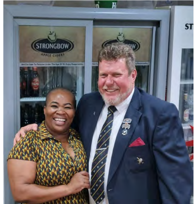
The Best Bar Tender in the Land.....The end